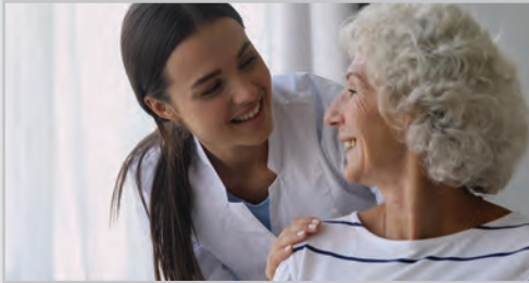
WHAT YOU SEE