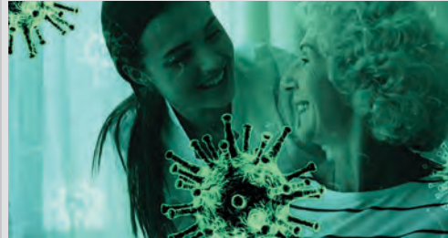
WHAT YOU BREATHE