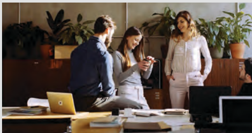
WHAT YOU SEE