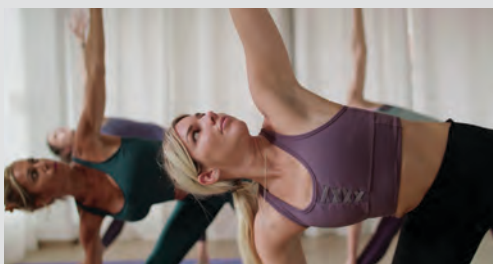
WHAT YOU SEE