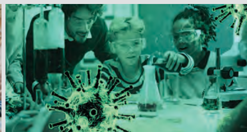
WHAT YOU BREATHE