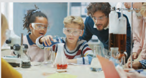
WHAT YOU SEE