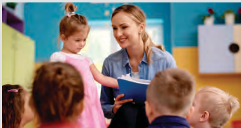
WHAT YOU SEE