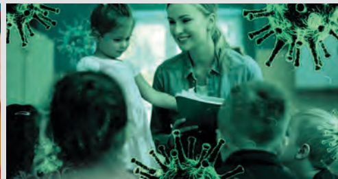
WHAT YOU BREATHE